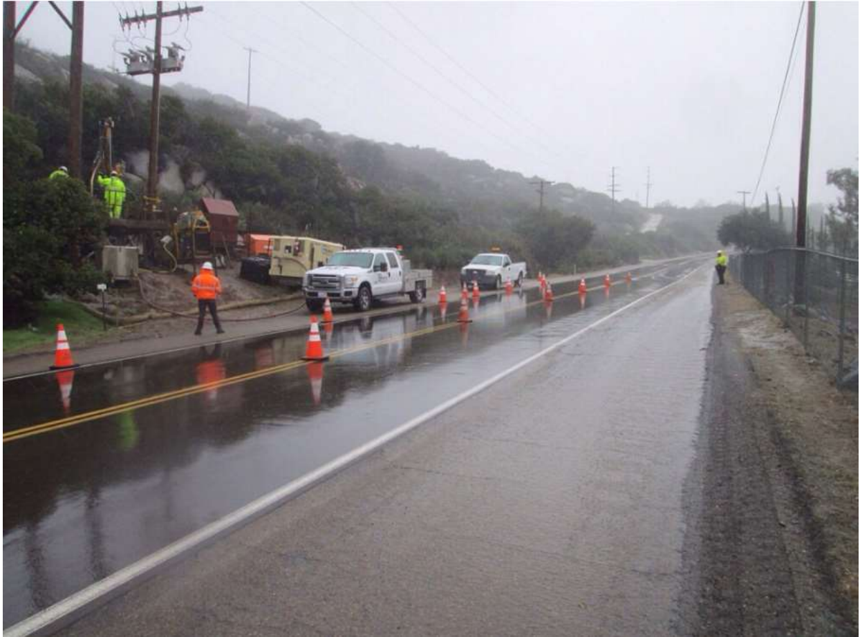
Photo 4: During micropile drilling at Pole Z272901 (TL 625B), a traffic control flagmen and cones were observed in place adjacent to the construction site along Japatul Road in accordance with APM TRANS- 02. Fiber Rolls were observed in place in accordance with the Erosion Control Plan (ECP) and SWPPP (MM HYD-1).