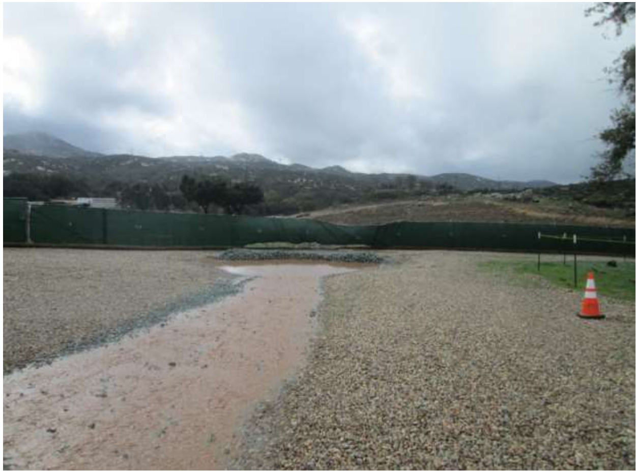
Photo 1: Due to the rain event that occurred this reporting period, velocity dissipaters and other erosion control BMPs were used to slow the rate of water flow at the Japatul Spur Yard in accordance with the SWPPP (MM HYD-1). Post-rain event, visual screening fence was observed repaired in accordance with APM VIS-02.