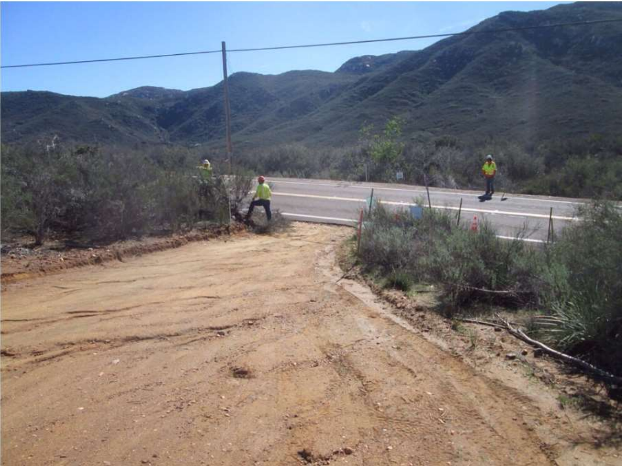
Photo 2: A construction crew was observed clearing vegetation within the approved workspace at Pole Z272870 (TL 625B) in accordance with MM BIO-1. A biological monitor was on site to monitor the activity in accordance with MM BIO-3.