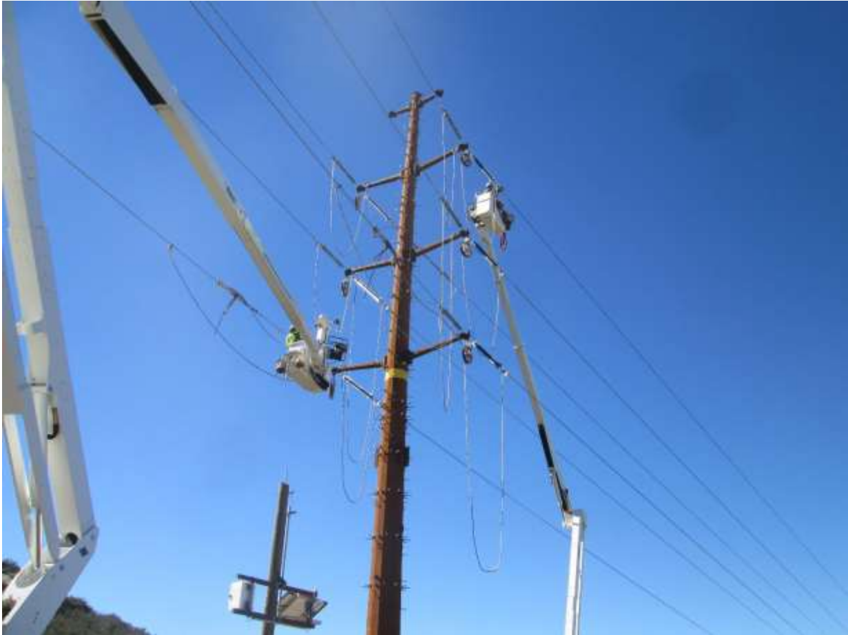
Photo 5: A line crew was observed dead-ending overhead wire at Pole Z44178 (TL 629E).