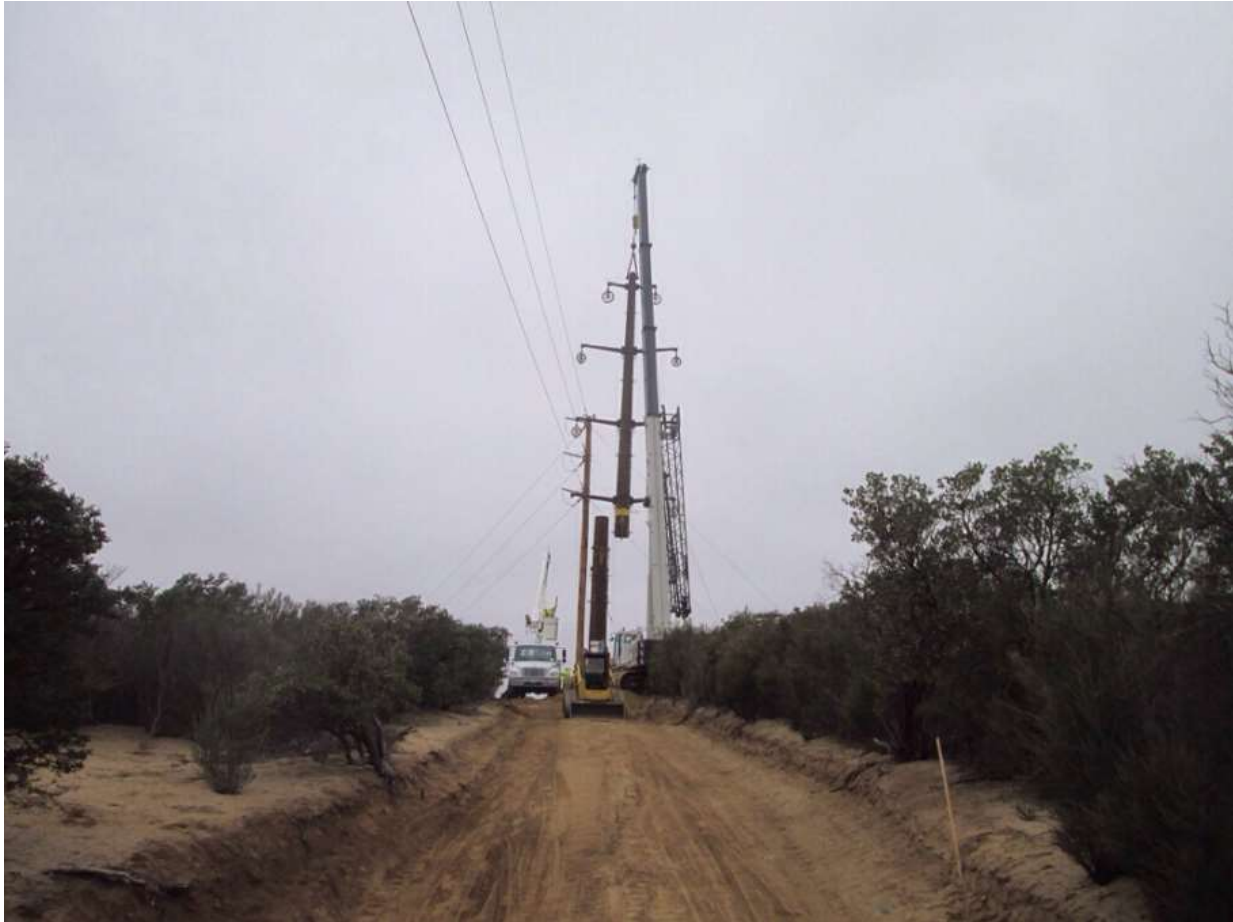
Photo 6: A construction crew was observed installing a steel replacement pole at Pole Z44168 (TL 629E). Vehicles were observed staged within existing access roads.